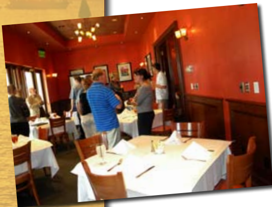
Attendees network before the August FWEA Manasota Luncheon.

I look forward to seeing you all at these great upcoming events. Have a safe and happy holiday season.